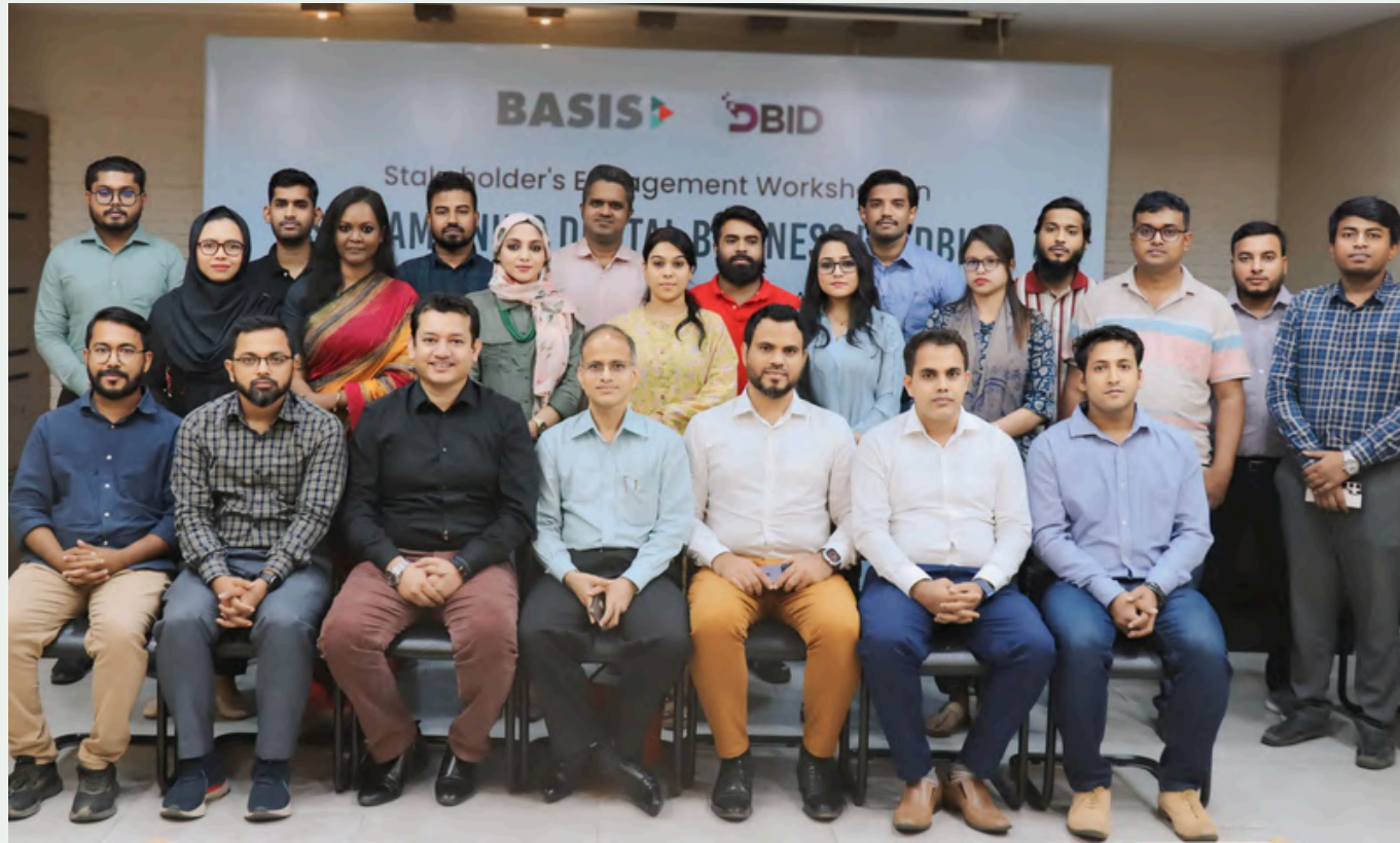
BASIS Stakeholder's Engagement Workshop