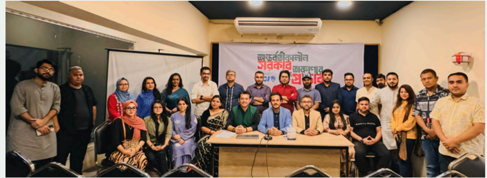
The role of the interim government: protecting and supporting entrepreneurs