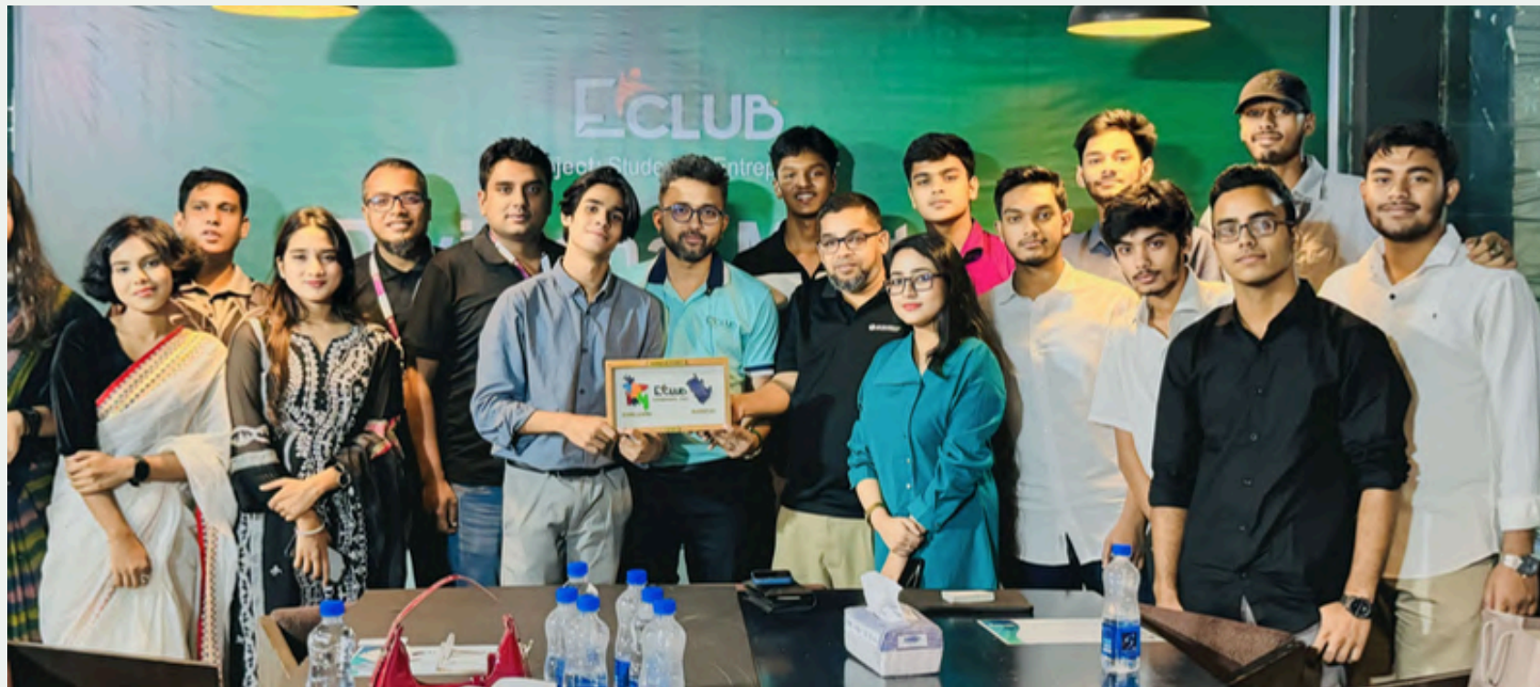
Student to Entrepreneur Project Rangpur 2024