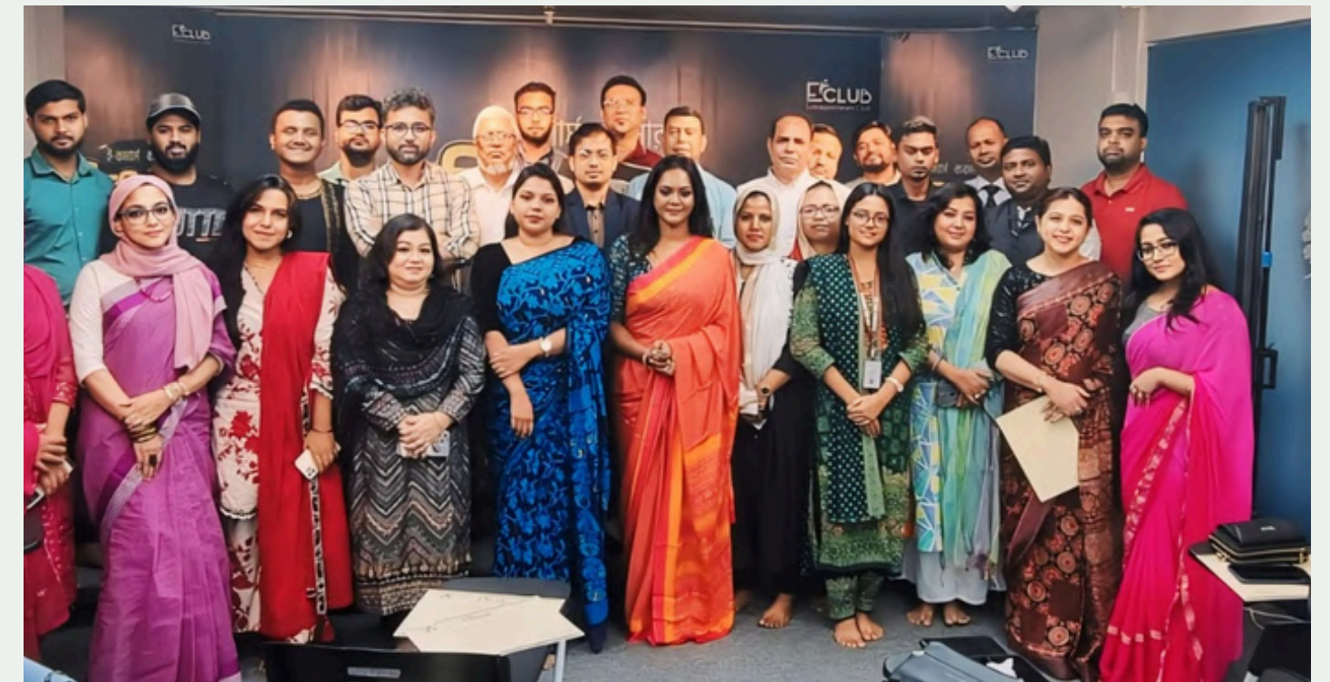
E-commerce Business Digital Tips